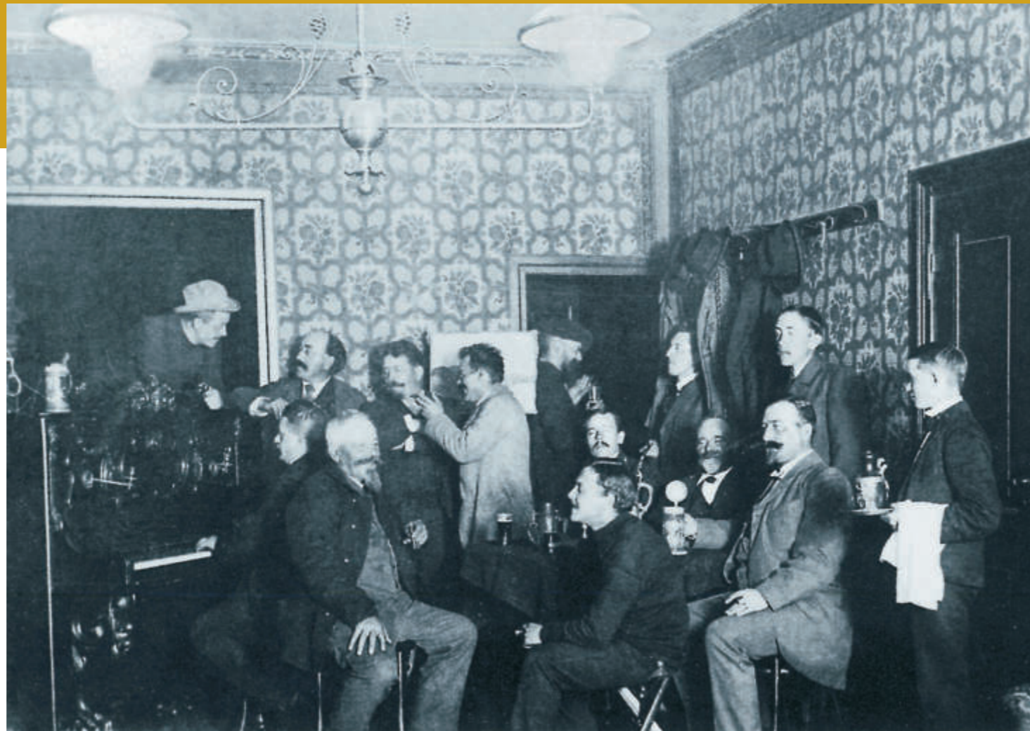
The painters of the Artists' Colony Schwaan in Hotel „Drewes“ in 1900's.